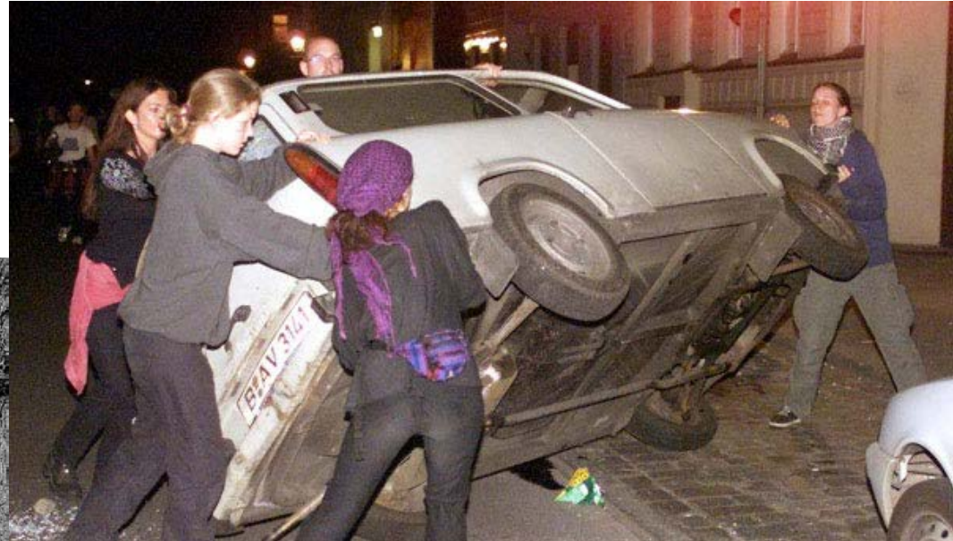
Demonstrators in Berlin on May Day, 2000.

On the afternoon of May 1, 1891, thousands of workers gathered in the plaza of Santa Croce in Rome to hear a series of speakers. A march of thousands more soon arrived, including members of the anarchist federation with red-trimmed banners. As the police chief noted, “The appearance of the Federazione Anarchica stimulated immediate excitement in the crowd.”